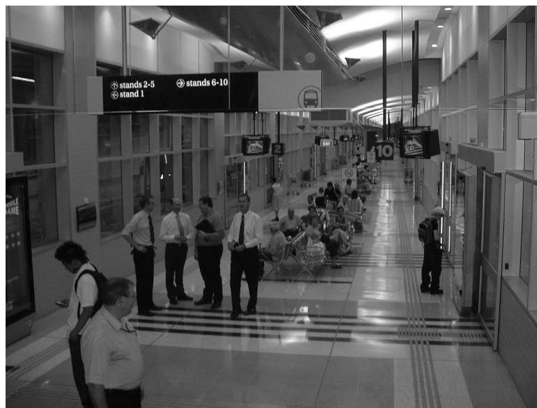
Blacktown Bus Terminal in shopping centre redevelopment