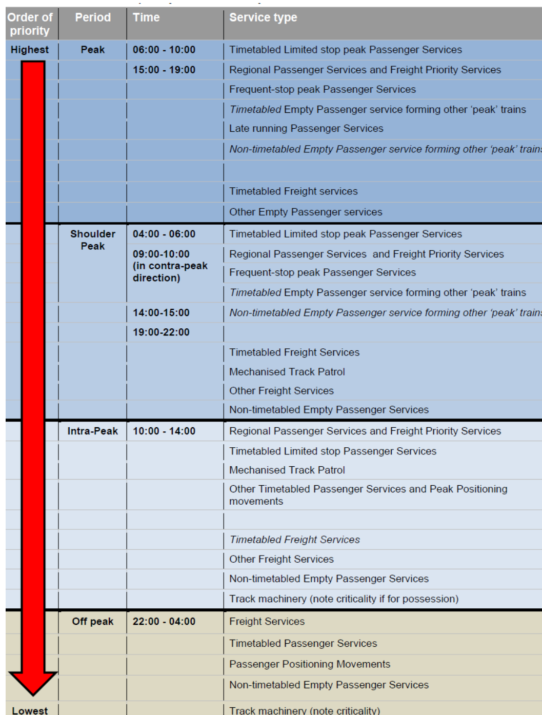
Exhibit 19: Path priority matrix - Weekdays