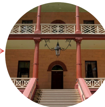
Parliament of New South Wales