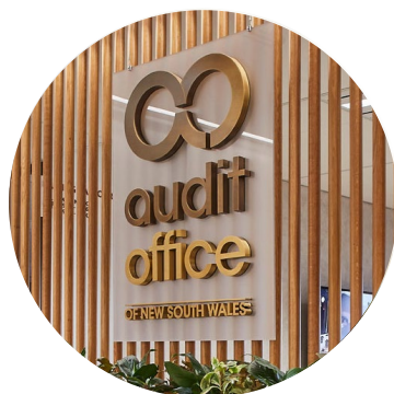
Audit Office of New South Wales

The Audit Office conducts financial and performance audits of state government entities, local councils and universities, principally under the Government Sector Audit Act 1983 (GSA Act) and the Local Government Act 1993 (LG Act) and examines allegations of serious and substantial waste of public money under the Public Interest Disclosures Act 1994 . The Auditor-General can also be requested by the Treasurer, a minister or both Houses of Parliament to perform audit or audit-related services. These can include audits of agencies' compliance with specific legislation, directions and regulations. Following changes to the GSA Act in 2022, our performance audits can also include non-public sector entities that have received money or other resources, (whether directly or indirectly) from or on behalf of a government entity for a particular purpose.